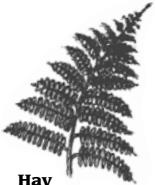
Hay Scented Fern

This clearing resulted when a tree fell. The hay-scented ferns that grow here are characteristic of disturbed areas. This fern's lacy, mint-green leaves quickly turn brown with autumn's first frost. Can you find the ferns?