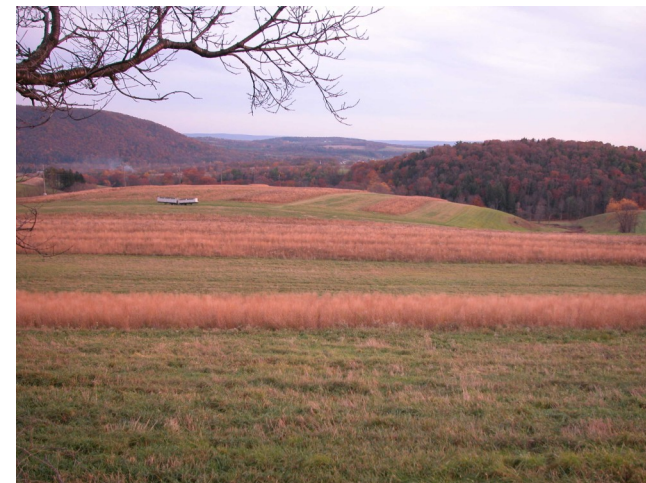
Wildlife habitat for working farms and forests

PGC and USDA - Farm Service Agency Schuylkill and Dauphin Counties