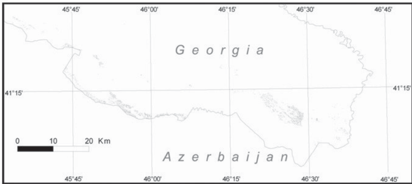
Figure 2. The distribution of potential Cinereous Vulture nesting habitat in Georgia in 2002, refined by using Landsat TM images.