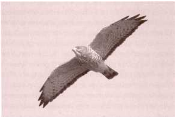
Fig. 5.106. The Broad-winged Hawk, Buteo platypterus .

The only estimate of the state population was derived by Partners in Flight using United States Fish and Wildlife Service Breeding Bird Survey data (Rosenberg 2004), resulting in an estimate of 36,000 birds in the state's forested habitat, with the largest numbers occurring in the Appalachian Mountains. The global population of broad-winged hawks had been estimated to