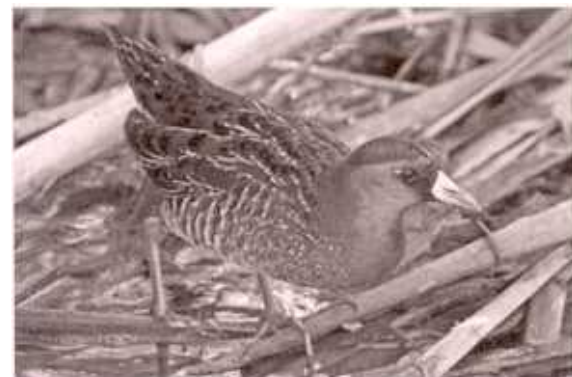
Fig. 5.108. The Sora, Porzana carolina.