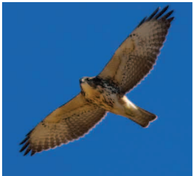
Figure 2 (top). Swainson's Hawks Buteo swainsoni arriving at their winter quarters in the eastern pampas of Punta Rasa, Argentina. At Punta Rasa, in mid November, if the winds are westerly or southerly, it is possible to tally thousands of these hawks in a single day. Most of those tallied at this site are immatures (Gabriel Battaglia)