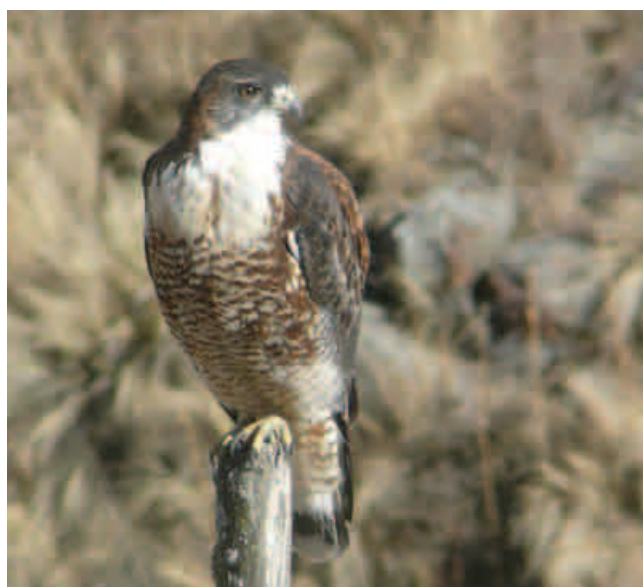
Figures 4–6. Immature Variable Hawks Buteo polyosoma ; from top and left to right below, first-, second- and third-years in their wintering ground around Tafí del Valle, Tucumán, Argentina. Each winter large numbers of immatures congregate in this region to feed on the large local rodent population. Some of these hawks might come from as far south as Tierra del Fuego (Matias A. Juhant)