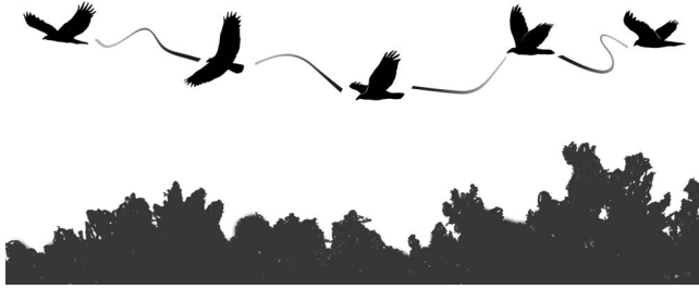
FIGURE 1. Illustration of a Turkey Vulture engaged in contorted soaring near tree height. The flight path, \sim 10 s in duration, deviates horizontally and vertically from a linear flight path while maintaining both altitude and general direction.

at intervals of \geq 5 min for our study. We paired behavioral observations with weather data by temporally interpolating weather parameters from the nearest meteorological station available (Table 1). Furthermore, at 15-min intervals we estimated cloud cover as clear ( < 20\% clouds), partly cloudy ( 20\text{--}80\% clouds), or overcast ( > 80\% clouds).