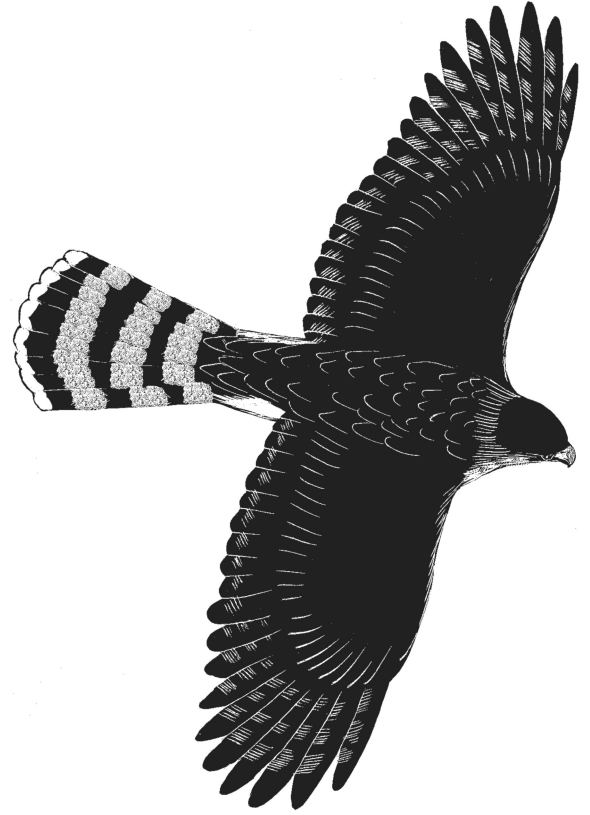
Cooper's Hawk