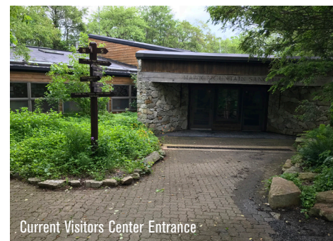
Current Visitors Center Entrance