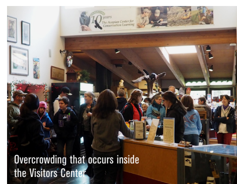
Overcrowding that occurs inside the Visitors Center